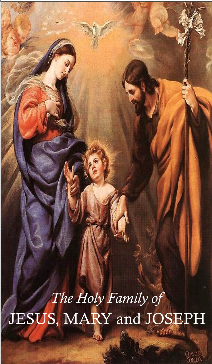
The Holy Family of JESUS, MARY and JOSEPH

30 minutes before every Mass Thursday & Saturday - 1 hour before Mass Anytime by appointment - Call the office to schedule