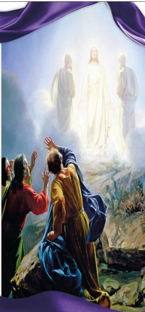
Transfiguration of Jesus by Carl Bloch, 1872